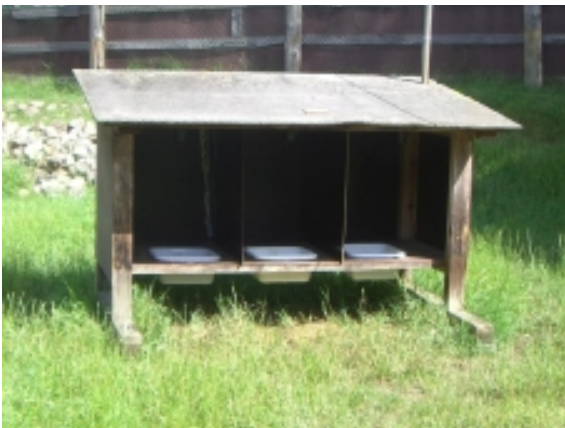
Figure A1. Experimental feeder with separated feeder compartments installed in one enclosure.